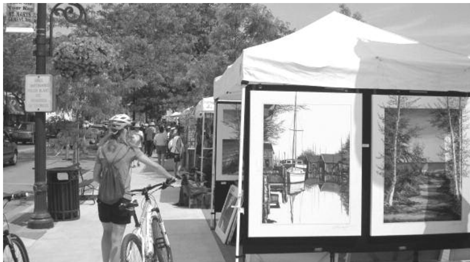
BELOW: From contemporary to whimsical, the Summer Solstice Art Show offers a wonderful representation of craftsmanship and artwork with many beautiful items on display.