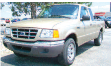
'01 FORD RANGER $7,875 Stk #80612A Great looking little pickup! XLT and only 75k miles!