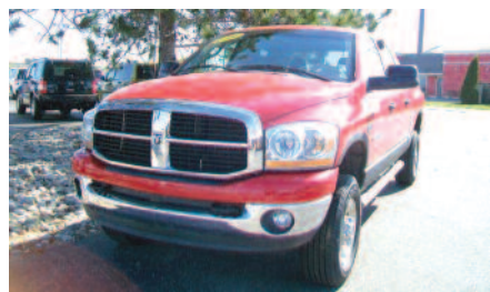
'06 DODGE RAM 2500 $21,994 Stk #P019676 Red & Ready- to haul your people and toys for the summer!