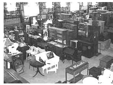
The fascinating facility encompasses over 7,000 square feet of ever changing vintage furniture and accessories, plus another 1,500 square feet of custom furniture items.