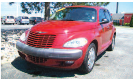
'02 PT CRUISER TOURING $6,991 Stk #76312A What?!? A 2002 beauty with only 46k miles. Hurry in now!