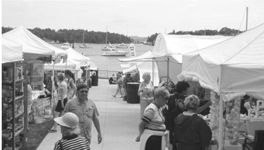
ABOVE: Over 70 artists will display their work at the annual Charlevoix Summer Solstice Art Show – taking place this weekend, June 16th and 17th, in beautiful East Park.

For details call the Charlevoix Area Chamber of Commerce at 231.547.2101 or visit www.charlevoix.org .