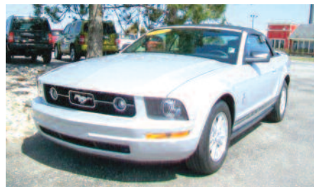
'07 FORD MUSTANG $16,992 Stk #76307A Only 25000 miles on this 1 owner convertible!