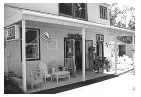
Kelly Antiques and Furniture Barn is located at 6176 Old US 31 South in Charlevoix.

ize in is wicker furniture items. People love old wicker furniture, and we also sell lots of old pine, oak and items made from other woods as well. Vintage furniture is generally made with solid wood or very good veneers. The workmanship and craftsmanship is excellent."