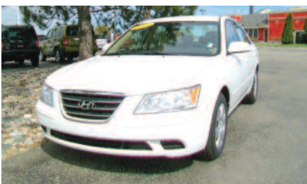
'10 HYUNDAI SONATA GLS $12,978 Stk #P049604 Best value on the lot! Get a lot for a little!