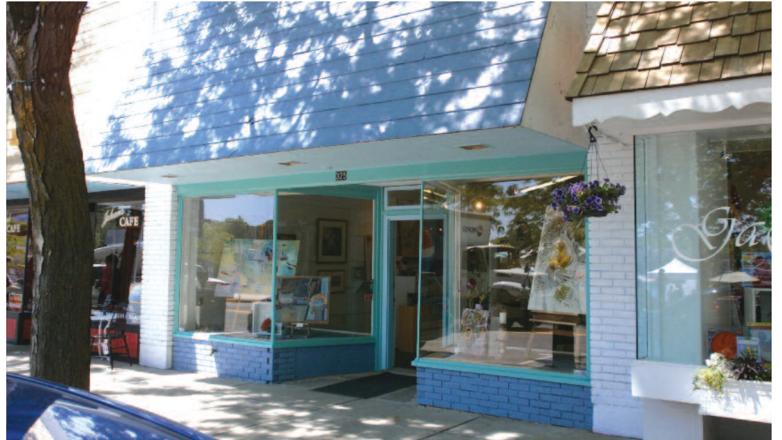
Outdoor signs are on the way...but inside the Round Lake Gallery the artwork is ready and waiting for area residents and visitors to peruse, and perhaps stop next door for a bit of pastry created at the newest branch of Johan's Bakery.