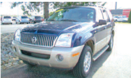
'05 MERCURY MOUNTAINEER $14,574 Stk #76621A Only 37000 miles! Leather, 3rd row and loaded!

You've seen the ordinary on every other lot... come see us for the extraordinary!