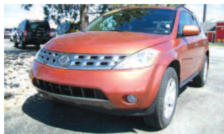
'03 NISSAN MURANO SUV $12,887 Stk #86320A AWD and only 66k miles. Great first car or everyday driver!