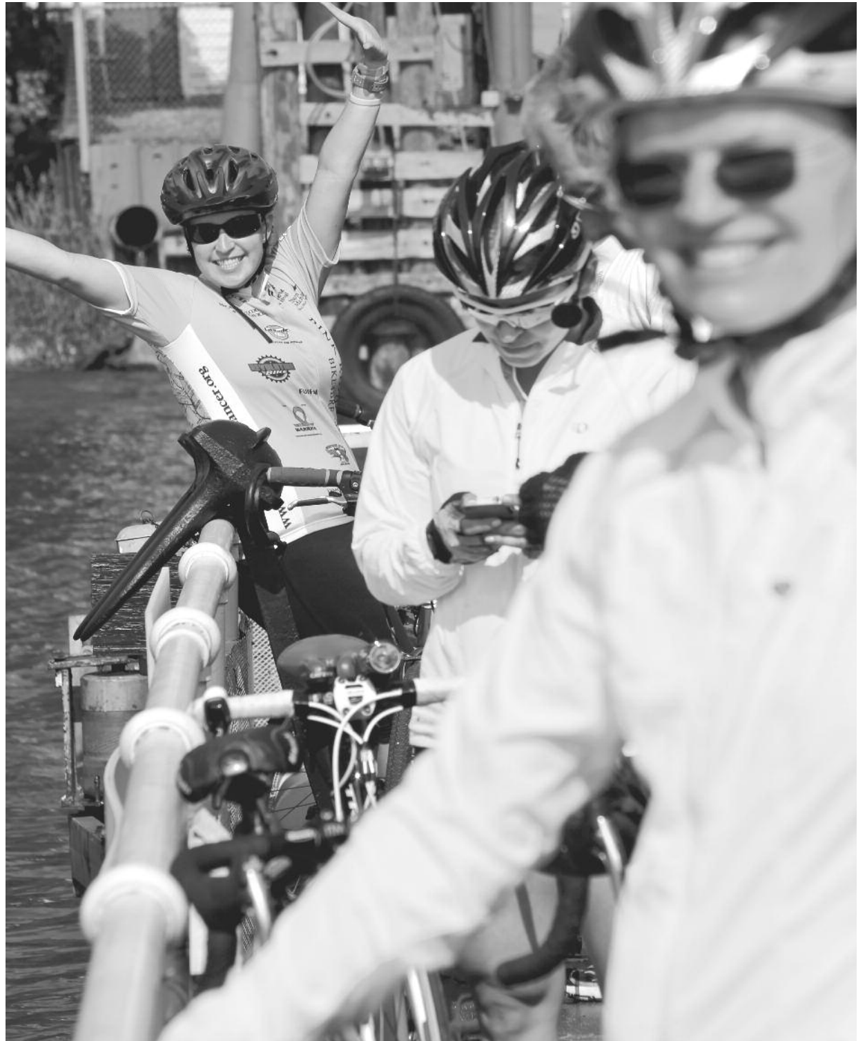
The 10th Annual Charlevoix/Emmet County Pink Ribbon Ride, raising awareness and funds for breast cancer programs offered through Charlevoix Area Hospital and Northern Michigan Regional Hospital, will get underway at Veteran's Park in Boyne City this coming Saturday morning.

To learn more about Bike4BreastCancer, visit www.bike4breastcancer.org .