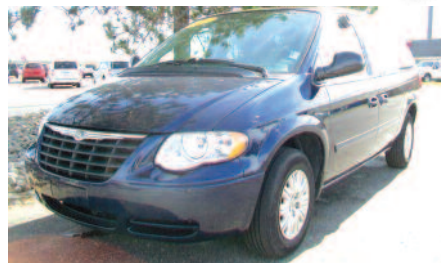
'05 TOWN & COUNTRY VAN $9,696 Stk #86300A People mover on a budget. Stow N Go. Only 74000 miles.